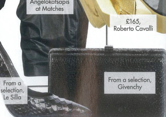
From a selection, Givenchy