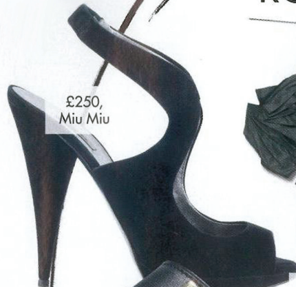
£250, Miu Miu