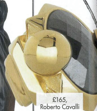
£165, Roberto Cavalli