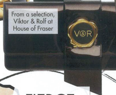
From a selection, Viktor & Rolf at House of Fraser