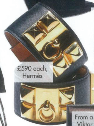
£590 each, Hermès