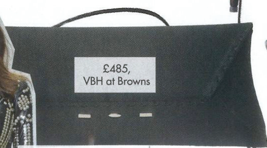
£485, VBH at Browns