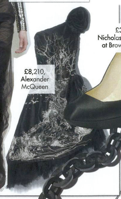
£8,210, Alexander McQueen